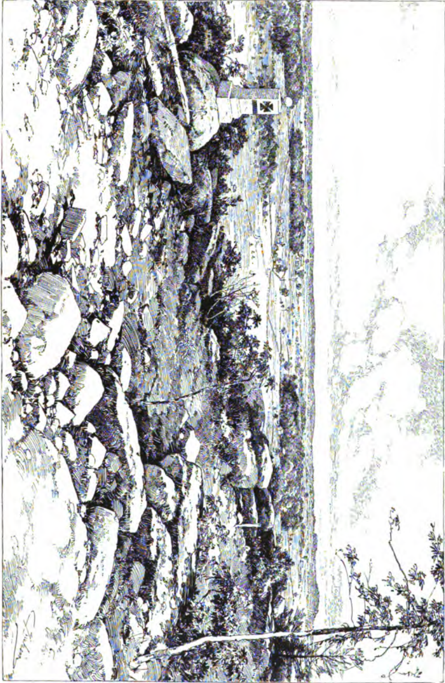
“OF HEROES THAT CAMP ON THE UNSEEN SHORE.”